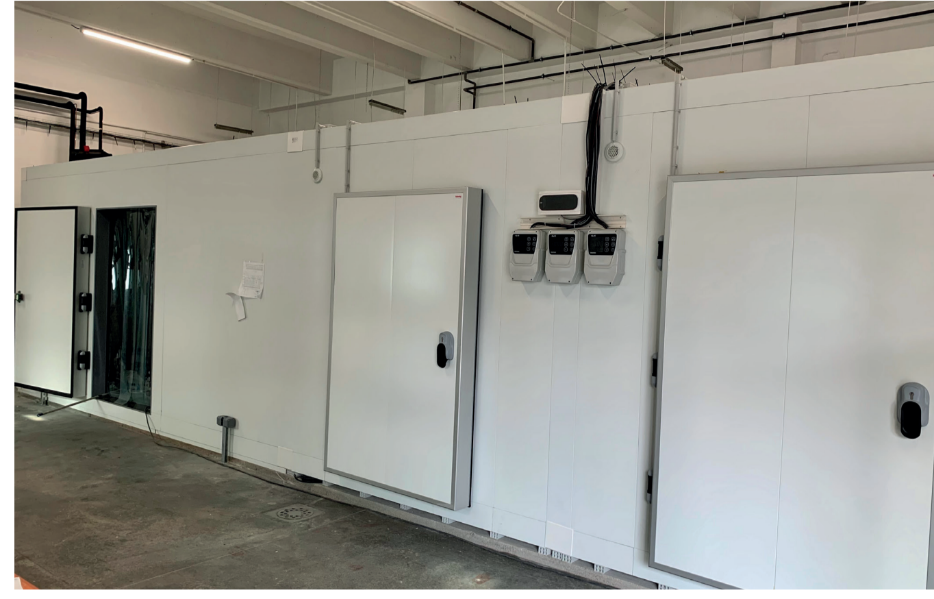
RescEU cold-storage rooms