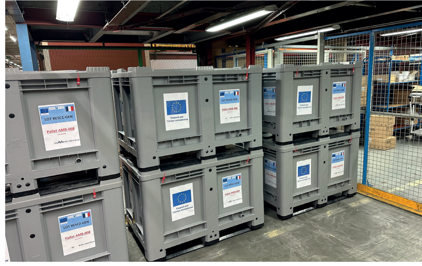
Pallet box ambient storage